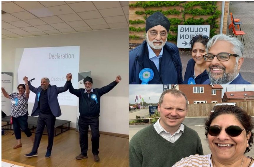
Installation of warning lights, local elections, colleagues, and mentors.